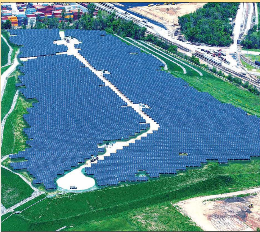
8.1MW Worcester Solar Landfill