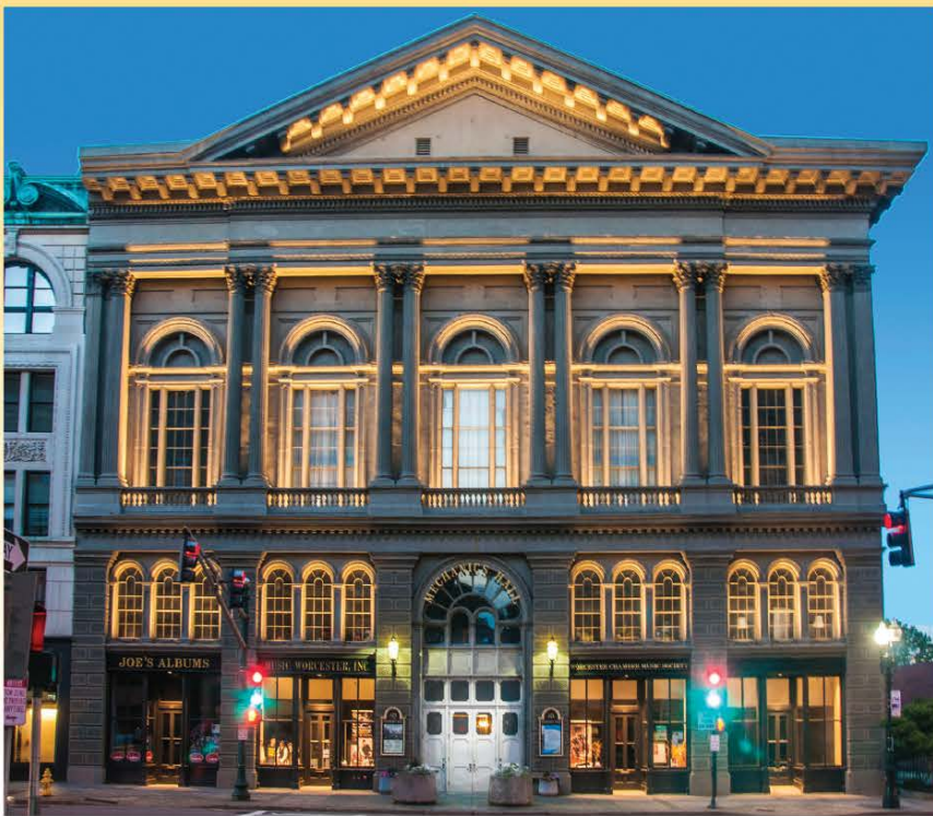
Mechanics Hall, Worcester