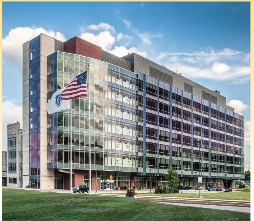
UMASS Medical Center, Worcester

The skilled electricians and technicians of IBEW Local 96 power Worcester's most prominent facilities with construction quality and safety that meet the highest industry standards – with consistent on-time, on-budget performance. It's why leading owners, facility managers, and general contractors rely on IBEW Local 96.