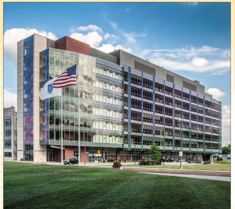
UMASS Medical Center, Worcester