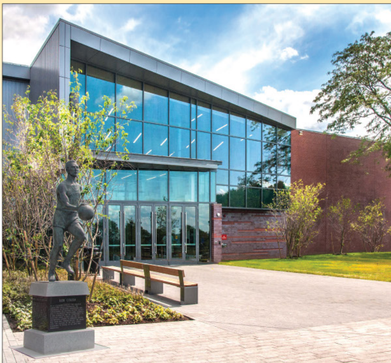
Hart Center, College of the Holy Cross