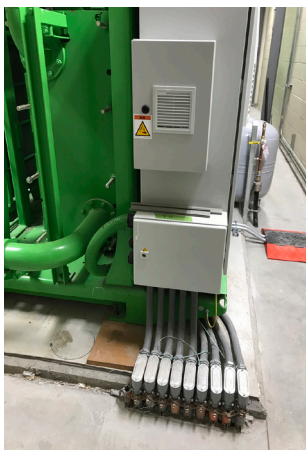
Control Wiring to Generator