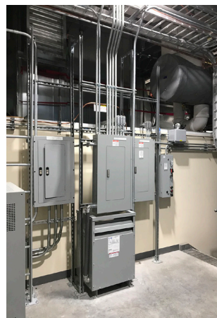
Panel Boards and Transformer