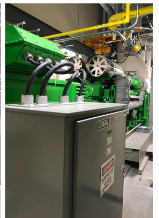
Power into High Voltage Cabinet