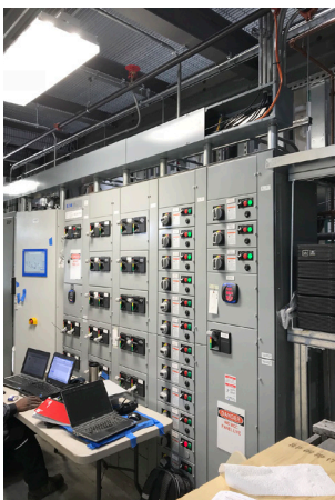
Motor Control Center