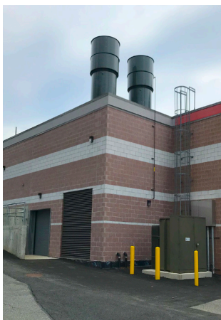
UMASS Leominster's CHP

GC: Harry Grodsky and Company, Inc., Springfield, MA; EE: NKE Engineering; Architect: DiGiorgio Associates, Boston, MA